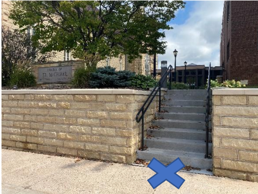
Stairs by St. Michael Church