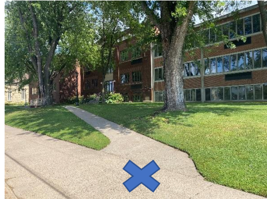
Side entrance by Willard Street